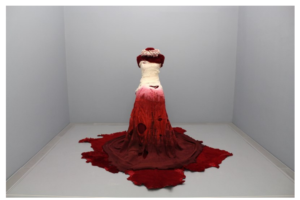
Kudzanai Chiurai in collaboration with Marianne Fassler - Untitled (Dress from Moyo)