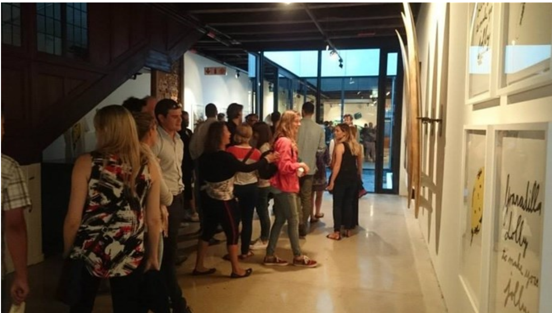
First Thursdays at SMITH Studio