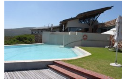
Newly rebuilt six years ago after a fire, the new lodge is architecturally interesting.