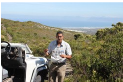
Nature guides deepen your experience.

The nature guides are clued in to the surrounding fynbos experience and succeed in decoding the sights, smells, and sounds to give one a deeper experience of the land. Did you know that old man's beard, (a type of lichen), is used to dress wounds or that the trees in the Afromontane Forest dry their top leaves at the first hint of fire to protect the forest from burning?