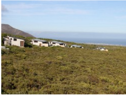
Forest Lodges are positioned to provide perfect privacy.

When assessing the value of something most of us look at what's there. What do we get for our money? At Grootbos, you must consider what's not there. There isn't pollution (unless you're allergic to fynbos pollens), there isn't noise (unless the sound of birds and the crashing sea is bothersome) there aren't crowds - even at full capacity the 1768ha reserve is vast so it is easy to feel oneself alone, in nature.