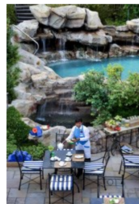
Now this IS cool.

For more information go to www.12Apostleshotel.com or call +27 (0) 21 437 9255.