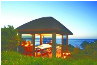
A little piece of heaven.