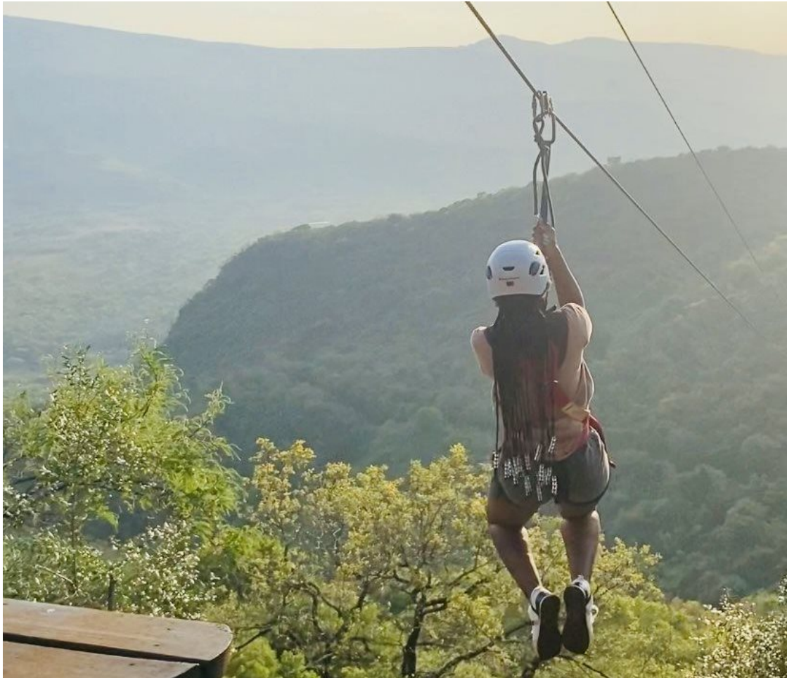
Ziplining is part of the adventure in Mpumalanga

Fondly known as the place of the rising sun, Mpumalanga has astounding beauty, breathtaking wildlife and many irresistible tourist attractions.