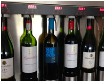
Fancy a glass of wine?

As a non-drinker, the impressive beverage offering - dispensed from oxygen-limiting temperature controlled devices so that each glass is as fresh as the one before it - is wasted on me.