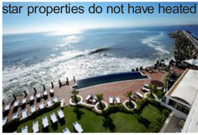
Much closer and you'll be soaked!

star properties do not have heated pools, even in summer. There is a rim-flow pool with a blue-tile mosaic that magically matches the sea beyond.