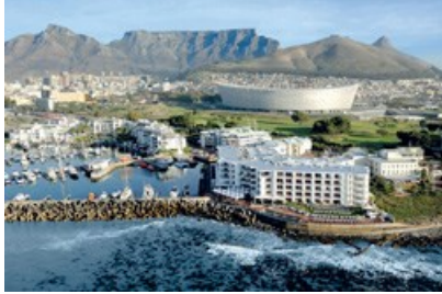
Perched on the water's edge... It's like being at sea.

Positioned on a promontory in Granger Bay made from reclaimed land, the Radisson Blu Hotel, Waterfront gives the impression of being an ocean liner. You will hear and smell the sea throughout your stay and, if you're in one of the sea-facing rooms, the sea views are seriously spectacular.