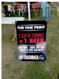
"Trashback" beer for stompies swap