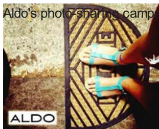
"Aldo Ring My Bell" campaign