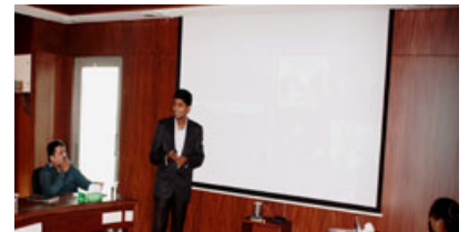
Make sure that you have specifically chosen each and every element of your presentation, and for a very good reason.

But never distribute your hand-out version beforehand. If you do, people will read ahead instead of listening to you. It's one more distraction to keep them from focusing on your message. It also eliminates surprises you've built into your 'show'.