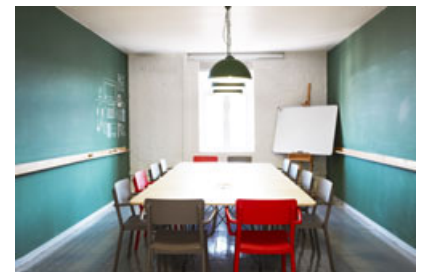
You can hire the boardroom if you wish.

Whilst all users get free local-roast coffee and a bundle of super-fast Wi-Fi; monthly members also gain a pack of value-adds, which include a yearly night at both Daddy Long Legs and Old Mac Daddy hotels, priority and discounts on events and a profile on the Daddy.O website. Users can also work with crowdfunding partner Thundafund to generate capital for new products and ideas.