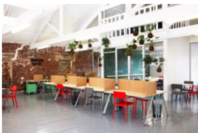
One of these work stations could be the place your own business was born.

Members also get 20% off all Daddy's Dragon's activities. This is the group's incubator and hosts courses and workshops to help entrepreneurs hone their business ideas, fine tune their marketing strategy and make lasting business connections. For projects with the right combination of vision, skills and commitment there is also an opportunity to incubate a business in partnership with the innovative founders and owners.