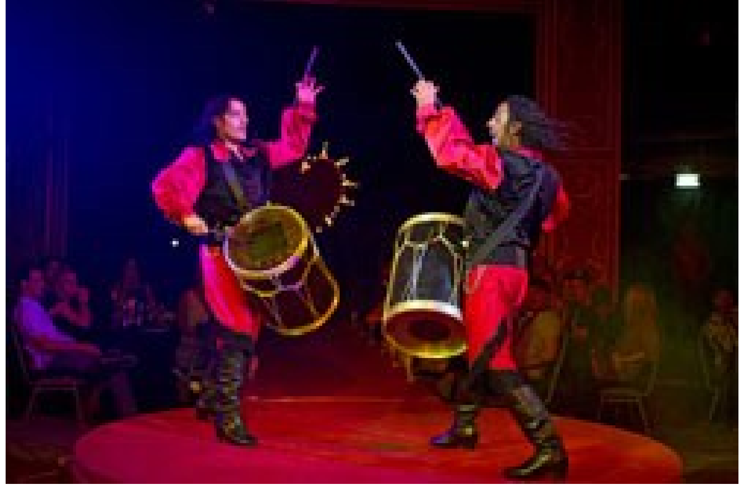
Grown-ups sat frozen in childlike wonder