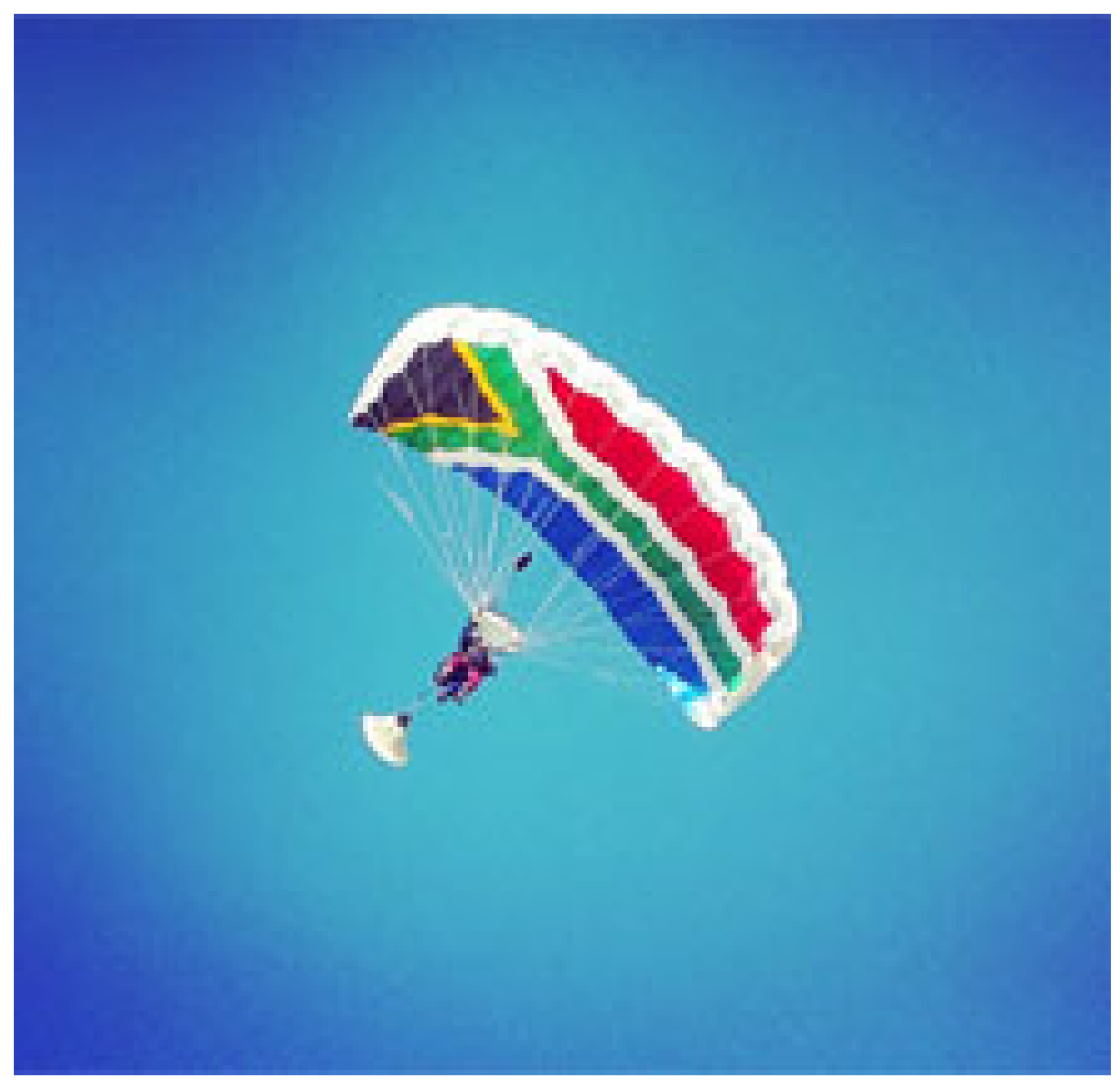
All 30 Axe Space Cadets took a tandem skydive