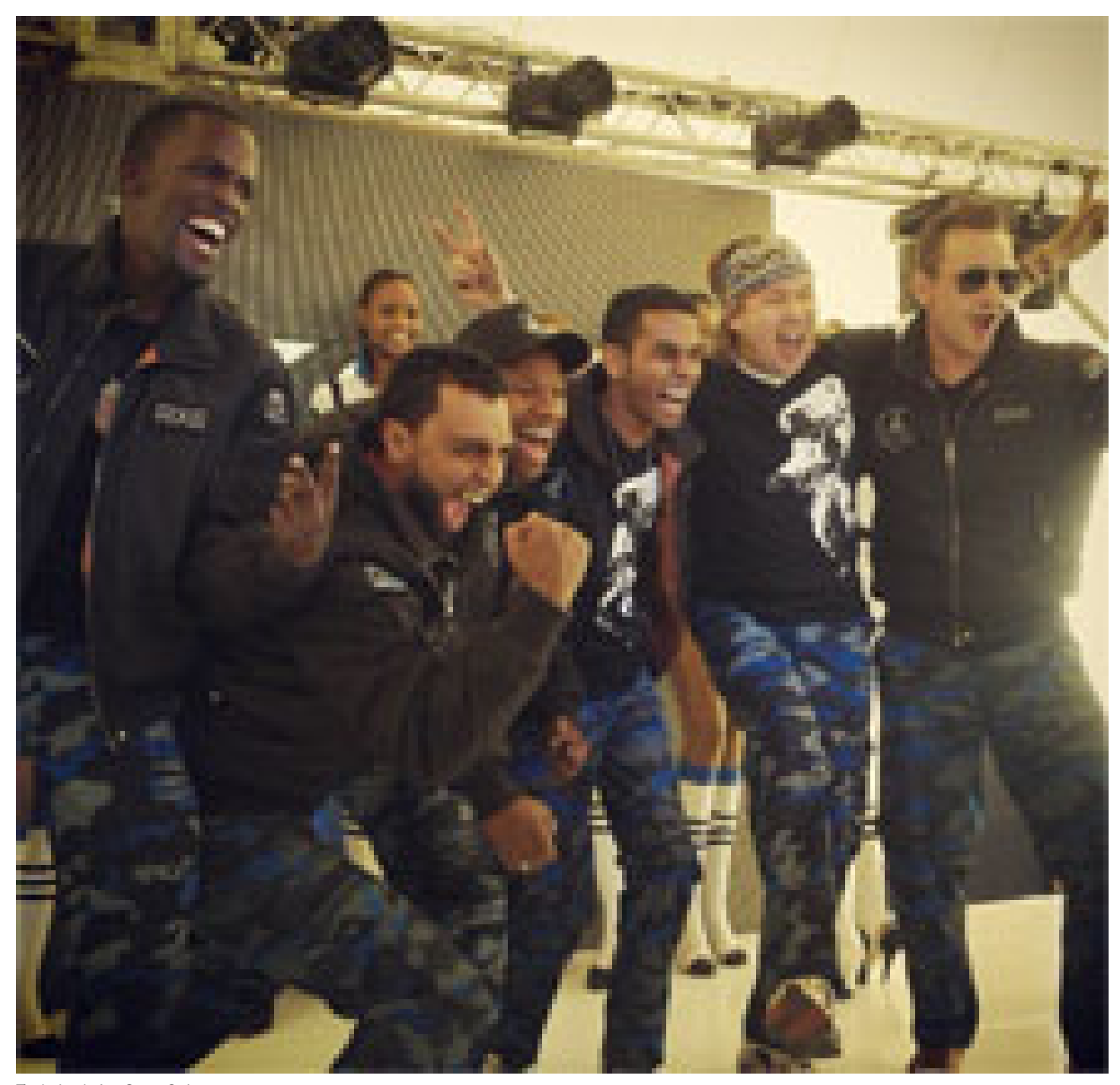
The lucky six Axe Space Cadets