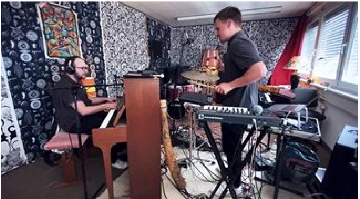
Seba Kaapstad – Virtual Jazz Unplugged Session (Live collaboration between South Africa and Germany)