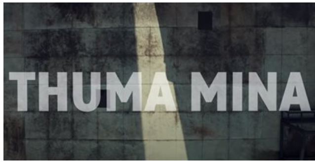
The Masekela All-Stars – New Thuma Mina Recording