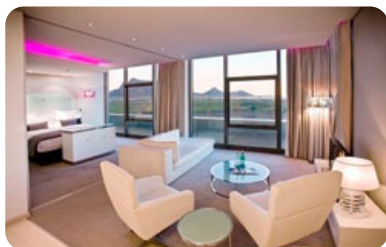
The view from the suite.

I've changed dramatically in the two years since I first stayed at African Pride's Crystal Towers Hotel so on this visit I was looking for ways in which the hotel had also changed.