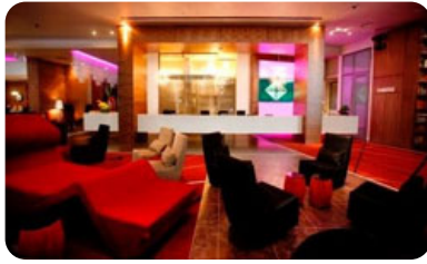
Relax in the lounge.

There is a balcony of sorts on the top floor and while there is a door to it a key wasn't immediately obvious so they're obviously afraid of jumpers. There is also no decoration on the balcony which I think is a wasted opportunity but I can imagine that on a windy day not much would remain so many floors into the sky.