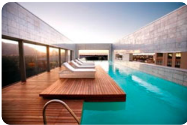
Fancy a dip?

The first floor cafe, spa and pool deck is dazzlingly bright with its white on white decor but a lost opportunity is not to provide a heated pool. The cantilevered pool is a striking visual feature of this hotel and more should be made of it. There are only many days when it is warm and wind free that a heated pool would make the outside area much more desirable.