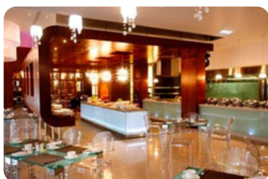
Breakfast at the hotel's ground floor restaurant