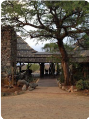
You know you are in Africa, but a luxurious Africa.

Rhulani is an intimate, family-friendly luxury lodge with the personal space and quality amenities to please the most discerning of travellers. Each room has a plunge pool that while small is wonderfully deep, refreshing, and timber-framed windows and doors that open back entirely to the balau deck. There is slate and rough stone work but most of the suite is clean-lined with screeded concrete floors and high thatched roofs. There is a Morso wood-burning stove as well as an air conditioning unit so guests will be comfortable no matter the temperature.