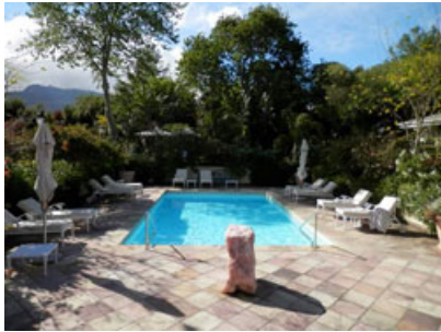
Nice quartz, nice setting.

I'd noticed the rock that acts as a centrepiece for the sunken pool and fabulous lawns and garden at The Last Word, Constantia but never paid attention to it. Now, the others who were joining us for drinks in the sunny lounge chimed in: "Look at it - that must bring lots of luck" while another, slightly less esoterically-minded friend remarked: "And cost a fortune."