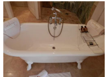
Time to luxuriate for a while.

Like the big quartz they're big on personal space and spa-sized bathrooms. There is a huge ball-and-claw Victorian-style bath and the travertine tiles and cream-coloured carpets are heated. Decorative mosaics are a trademark of most of these properties and at The Last Word, Constantia they form the backdrop of the family-sized shower in a local version of Van Gogh's Starry, Starry Night . There are also mosaics of an arum lily and of a sun bird in the private garden directly outside the suite's sitting room.