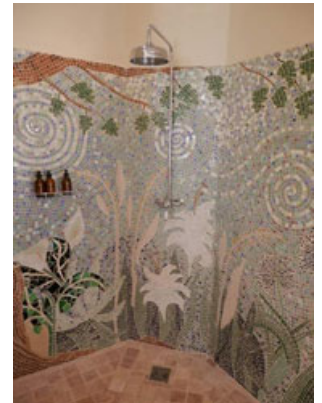
Room for two - and more mosaics.