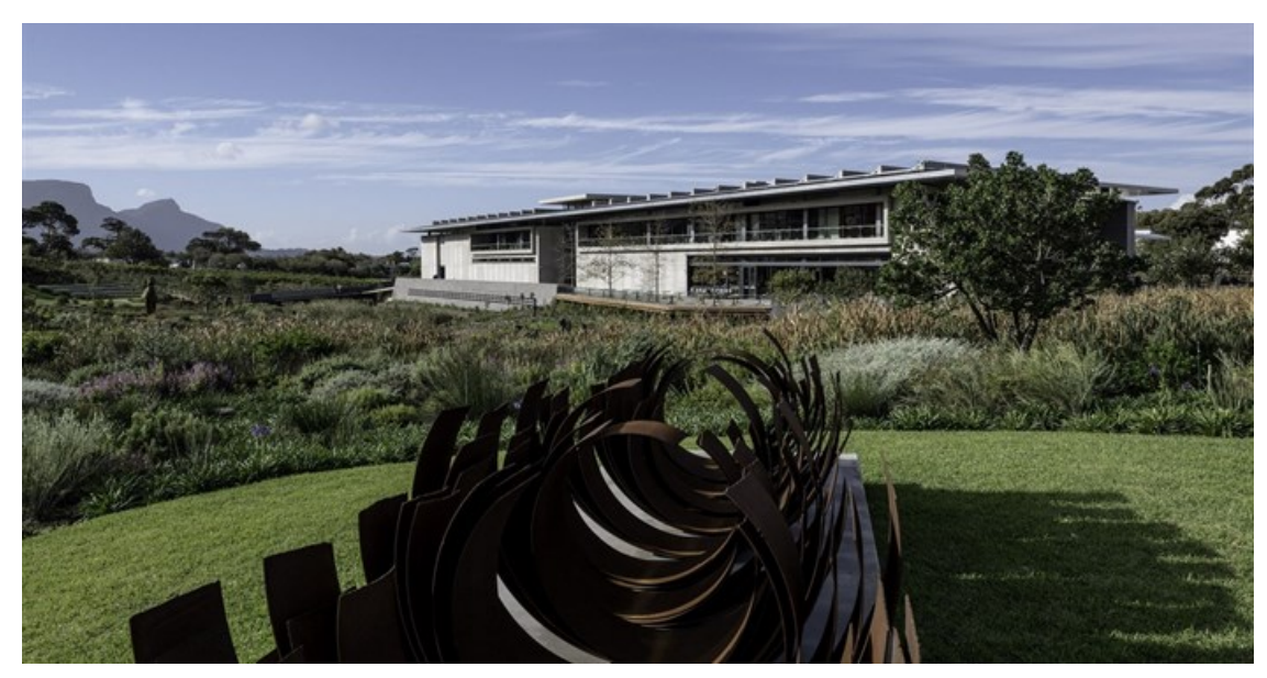
Norval Foundation sculpture garden (Image Supplied)

Cape Town boasts many iconic experiences, but it is fast becoming the world's newest art hot spot. Now there are new experiences for art aficionados - beyond the Museum of Modern Art in New York, the Tate Modern in London or the Louvre in Paris - as Cape Town finds its feet among the art capitals of the world, with artwork transcending the traditional craftwork mostly associated with Africa.