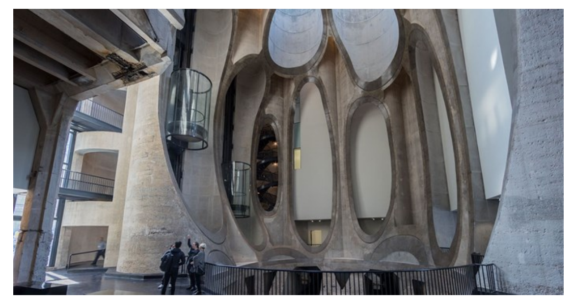
Zeitz Mocaa, The Atrium

The Norval Foundation building, which showcases one of the largest private art collections in South Africa, was designed to take account of the sensitive wetland bordering the ground it sits on. An integral part of the construction project was to create a sculpture garden between the building and the wetland, which is home to a colony of endangered Western Leopard Toads. The entire project serves as an example of the successful integration of construction development and the rehabilitation of damaged environmental spaces.