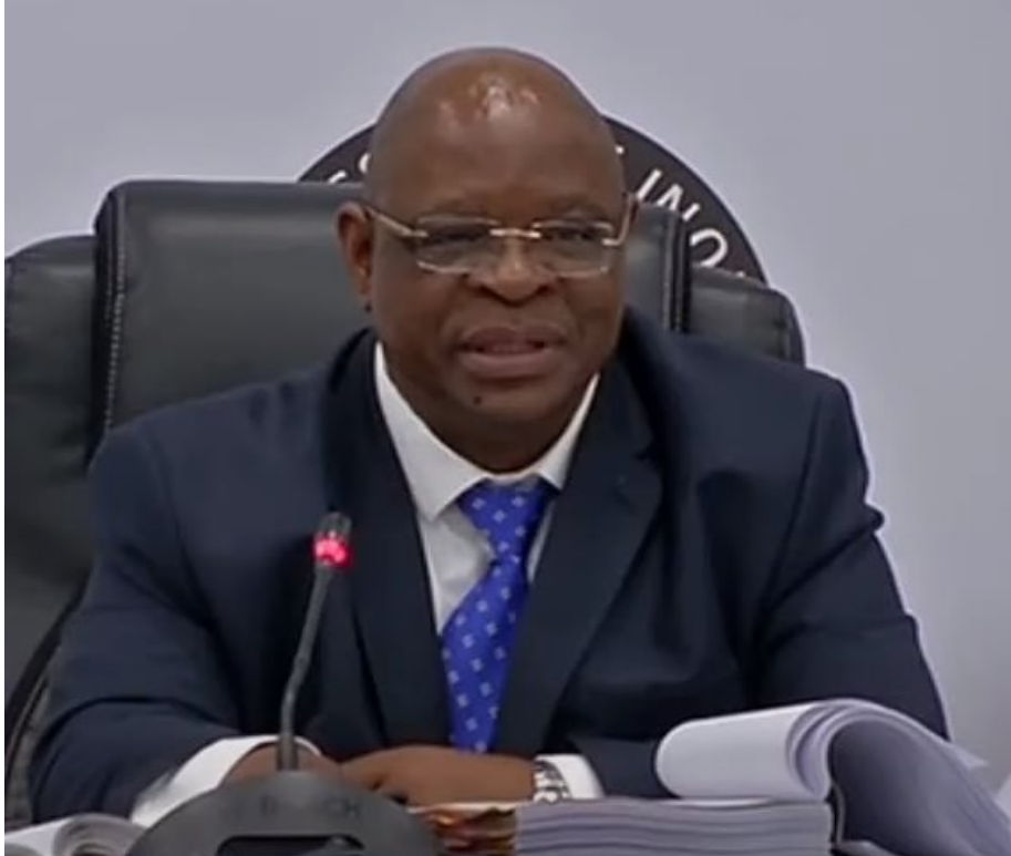
Deputy Chief Justice Raymond Zondo

The commission of inquiry into state capture has by and large finished its oral evidence, save for a few witnesses who will be heard during the month of July, including President Cyril Ramaphosa. This has been confirmed by Deputy Chief Justice Raymond Zondo, who chairs the commission, as he led a press briefing on its work on Wednesday, 30 June 2021.