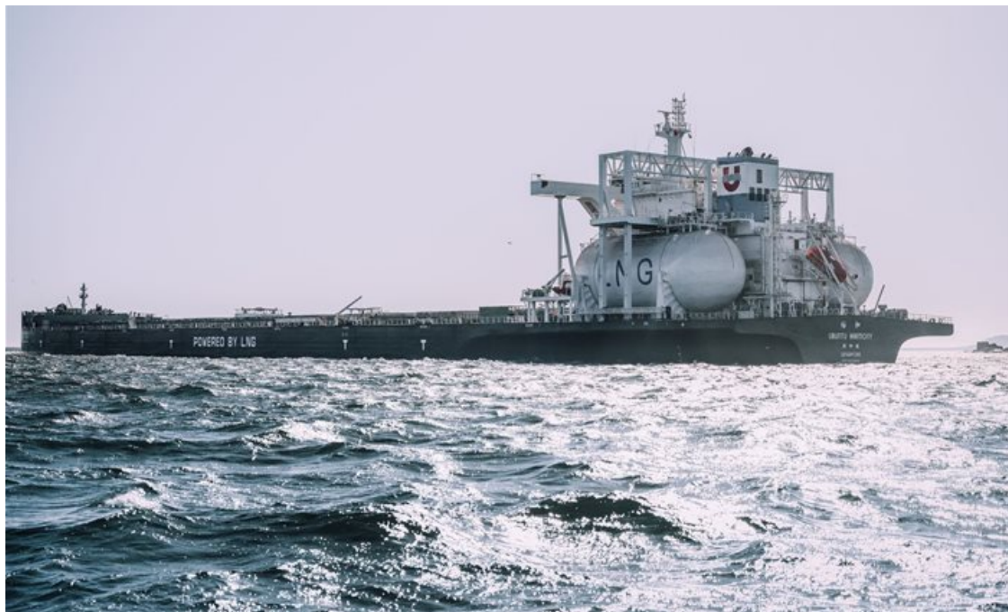
Anglo American's Ubuntu Harmony. Source: Supplied

Anglo American announced on Thursday, 26 January, that its new LNG dual-fuelled Capesize+ ship, the Ubuntu Harmony, loaded its first cargo of iron ore from the Kumba mines in South Africa.