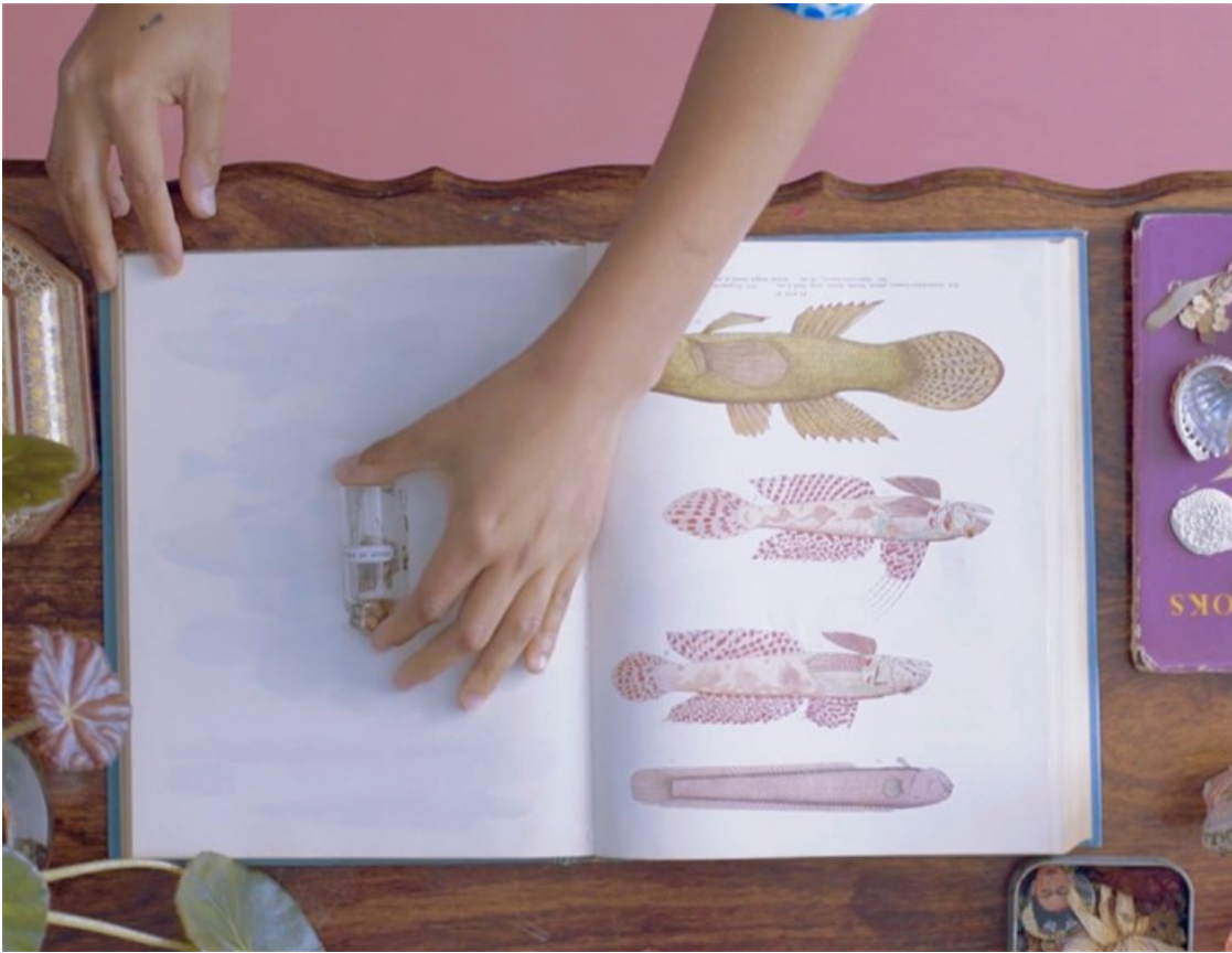
Still from Skin Diver

My story is quite long and detailed and takes a lot of twists and turns. I started using a film camera around the age of 13. Just documenting life, people I love, places and people I would move past. In retrospect, this became my first tool and method of training my eye. I loved the ability to influence how light was captured in a photograph using an analogue camera.