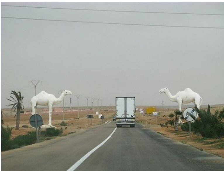
The biggest challenge to the completion of the highway is the diversity of terrain, from deserts in the north to dense vegetation in central Africa.

Improved roads in north and west Africa, and large-scale road building programmes in the Southern African Development Community and East African Community have gone a long way towards connecting and integrating Africa. The largest challenge remains in central Africa, where difficult geography and a lack of road infrastructure have made improvements challenging.