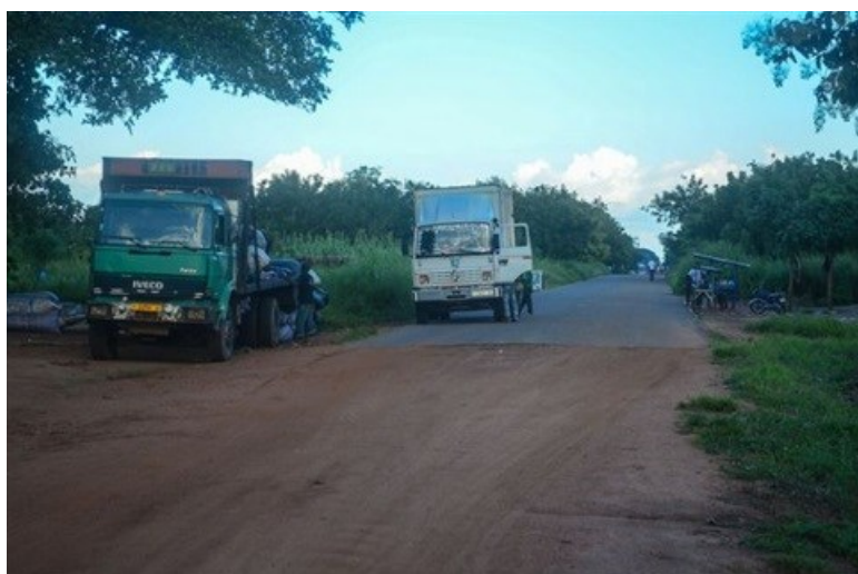
Maintaining existing roads is the challenge for governments. In Africa 80% of paved roads remain in fair condition, and 85% of rural feeder roads are in a poor condition.

At present, 40% of Africa's population lives with two kilometres of a tarred, all-weather road; doubling that access would cost about $32-billion. But spending the money would improve economies and improve food security for Africa's one billion people. Some governments have begun to prioritise rural road investment based on the agricultural value of land. Instead of investing immediately in building the 1.5 million kilometres of highway needed, an immediate improvement in prospects can be gained by building a network of 600 000 kilometres in rural agricultural areas.