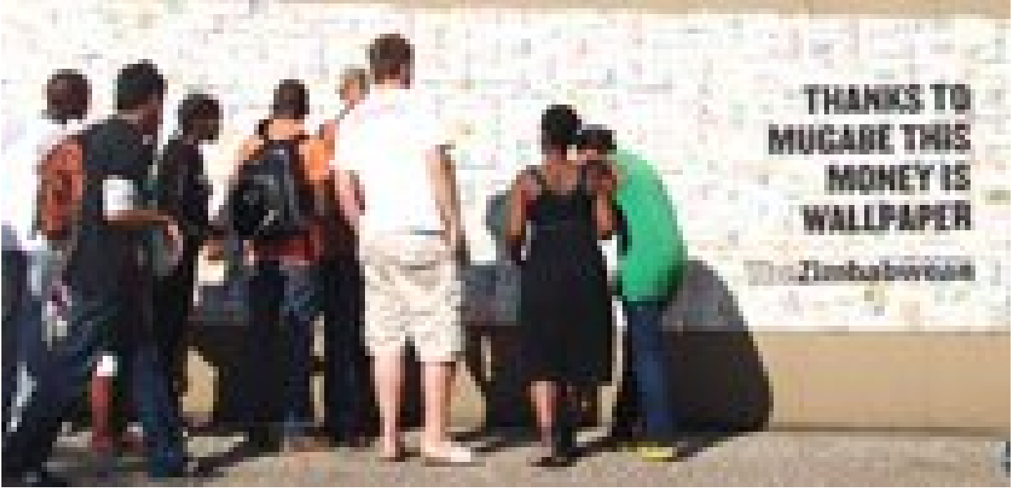
Wall at Wits University