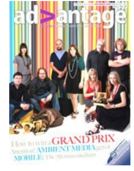
Advantage November 2009 issue

In the November 2009 issue of AdVantage magazine, we ask what it really takes to win the highest advertising accolade: a Cannes or Loeries Grand Prix. Luck? Talent? Entering as many awards categories as you can? Sex, drugs and rock 'n roll?