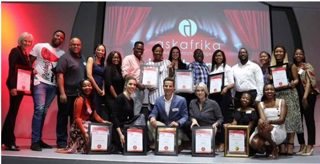
The 2019/20 Ask Afrika Icon Brands Top 10 winners

The Icon Brands survey is the holy grail for brand owners as it measures brands that consumers buy and use on a regular basis. This is the most difficult to achieve, compared to brand footprint, affinity, or brands that consumers claim to love.