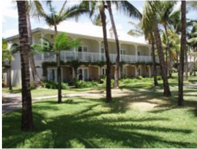
Olde worlde charm coupled to unbeatable service adds up to an unbeatable experience.

Good old plantation (colonial) architecture, good old plantation hospitality. Sugar Beach is the ultimate resort to relax... Where a couple of days feels like a week - and you could be excused for not falling down if you saw Rhett Butler lugging Scarlet past you up the stairs and telling her 'Frankly, my dear, I don't give a damn - you're coming upstairs to check out my new luggage. And that's an end to it!'