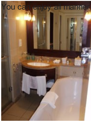
Say no more...

of water and land sports and activities by day, the romance of the starlit tropical sky at night and glorious food with a feast of Mauritian, Mediterranean and world flavours. The range of facilities makes the resort ideal for incentives, as well as couples and families experience the best of famed Mauritian hospitality.