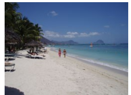
The beach is great and you have plenty of space to wander off and find a spot just for yourself.

Sugar Beach opened in 1996 and was renovated in 2008, with an upgraded public area, renovated decor and 20 extra rooms. The renovations also saw the addition themed buffets.