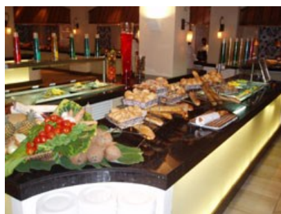
Another shot of the Mauritian themed night delicacies ... The food at all of the hotels we have stayed at has been excellent - as a bulging waistline will attest.

If you feel like getting your feet wet , then you can try everything from complementary facilities such as kayaks, laser sails, glass-bottom boat trips, snorkelling, windsurfing, fun boat, aqua gym classes, water polo, volley polo and basket polo. Also on offer are non-complementary activities such as scuba diving (PADI open-water courses available), big game fishing, water-skiing, parasailing, and full-day catamaran cruises - we did the latter. Great!