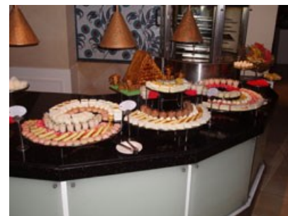
The Mauritian themed night saw this sort of thing laid out; needless to say it didn't seem to last very long before new stocks had to be brought out.

If you're not into long walks interspersed with hitting dimpled balls, then Sugar Beach has a range of alternative activities on land ranging from aerobics to martial arts to Pilates (no, not pirates... Pilates), tennis and yoga, and all aching points between.