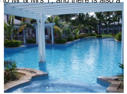
If you don't fancy the beach, then try the pools.

So if you want a day to remember - remember this is where you heard about it. By the way all the group's hotels offer this service.