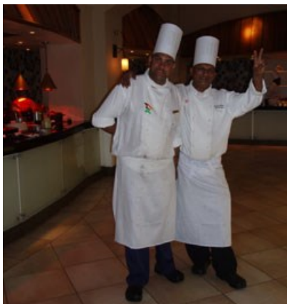
I blame these guys and their mates for my clothing being a great deal tighter on the way back than when we arrived.

What I find great about all the Sun Resorts establishments we have been to is how the residential areas are removed from the central public areas, or, where closer to the latter, are largely shielded from the sounds of the other guests having a grand old time.