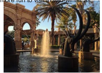
it's quite the waterworld as well.

What struck me about being a guest at The Palace was that the average age of the staff seemed far older than usual. I had the feeling that there were, perhaps, even second-generation staff working there. The maturity of almost everyone we engaged with gave me a confident and easy-to-relax feeling.