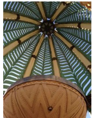
The architectural features are lavish.

I imagine that as Sol Kerzner set up planning his crown jewel of The Sun City complex that he wondered what other people with money, fame, and power such as he had might enjoy. This is a Disneyland for adults.