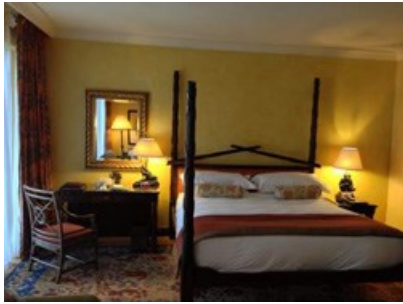
And after all that imagination running riot, where better than a comfy bed.

The Valley of the Waves is as impressive today and much more fun to visit in mid-winter as there were just a handful of others there. The water was too chilly to swim in for long but, compared with the wet Cape Town weather I'd left behind, simply being in the sun was bliss.