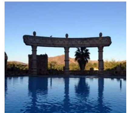
Fancy a dip?

Just over 20 years ago, moments after The Palace opened, I visited again and stayed at The Cascades. I remember touring The Palace and noting this was the first pool with underwater music, the extra ordinary Valley of the Waves with its wave machine, the first of its kind in the land and waterslides that still terrify with their adrenalin-junkie vertical drop made a big impression.