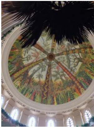
As we said above, the architectural features are lavish.