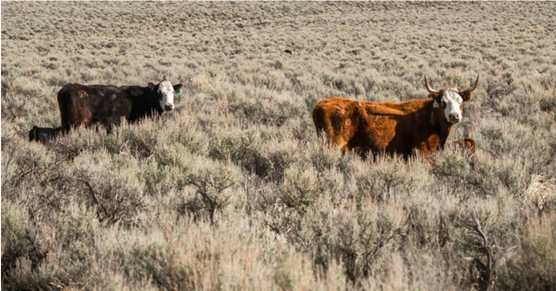
Cattle grazing on public lands near Steens Mountain, Oregon.

As the scale and impacts of climate change become increasingly alarming, meat is a popular target for action. Advocates urge the public to eat less meat to save the environment . Some activists have called for taxing meat to reduce consumption of it.