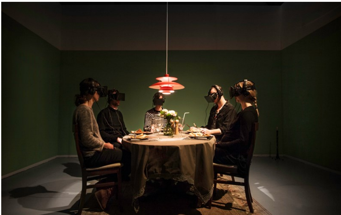
The Doghouse

"Creativate seeks to explore the space where creativity, innovation and technology converge. It's a playground for artists and audiences interested in how the digital age is helping to bring our imaginations to life, and who want to experience the creative tools of the future.