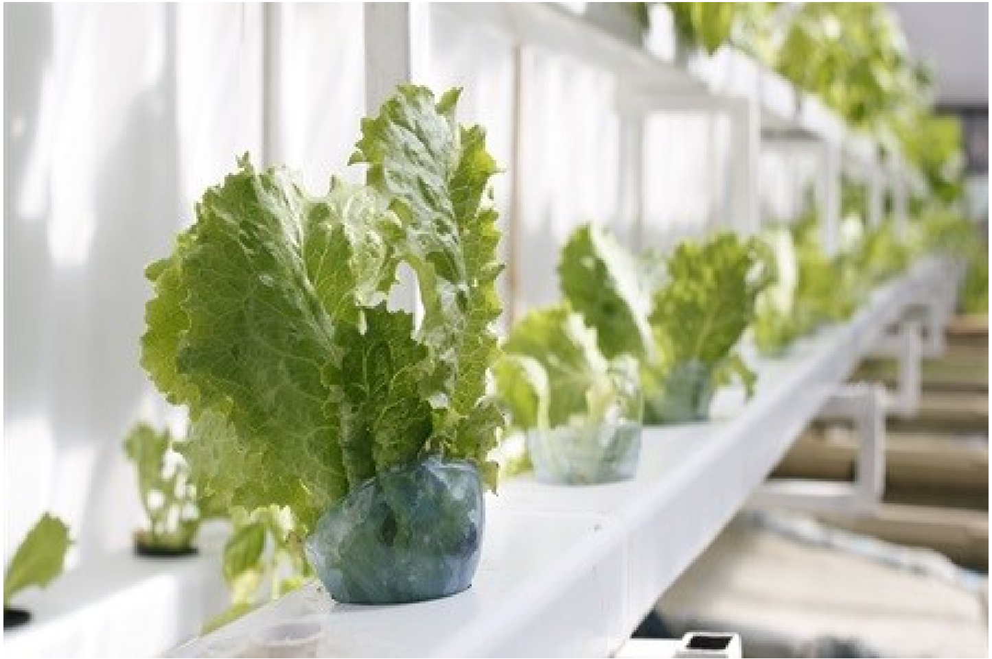
Selfsustainabilty initiatives, ecological systems