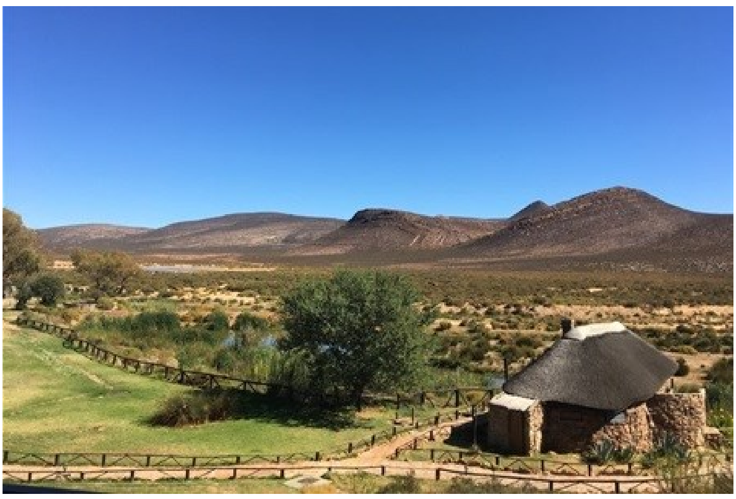
Once we were all freshened up, geared and ready to go (wearing our complimentary Safari hats - thanks Aquila!), we huddled together and climbed on board our safari bus for our sunset safari adventure.