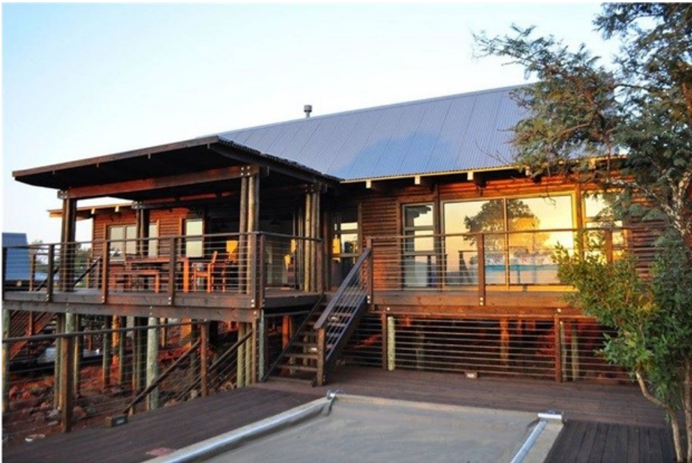
House du Preez - Eco Log Homes