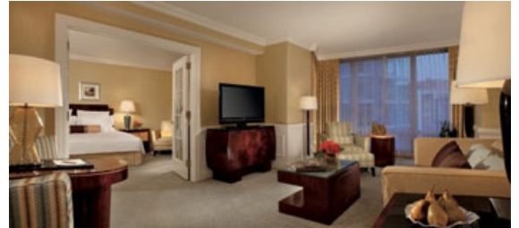
A Ritz-Carlton suite is just the place to enjoy all the amenities.

The 9th Floor suites have direct access to The Ritz-Carlton Club, a rarefied yet unexpectedly friendly and casual space. Staff get the balance between being personable and efficient spot-on and seem to know just how long to engage before imposing. I much prefer being asked my name rather than my room number (largely because I hardly ever remember the room I'm in) but at the club staff also introduce themselves by name which in the formality of the city is refreshingly casual. The impact of this intimacy is that hotel staff very quickly feels part of one's own team and because they're pre-empting your next request, another cappuccino or selection of chocolate desserts appears almost before being asked for.