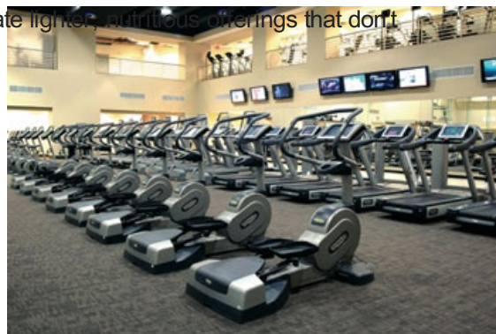
Just the place to get fit.

Hotel guest-books are displayed in the library and read like the whose-who of power. Prince Harry and Henry Kissinger were on the pages when I looked at it.