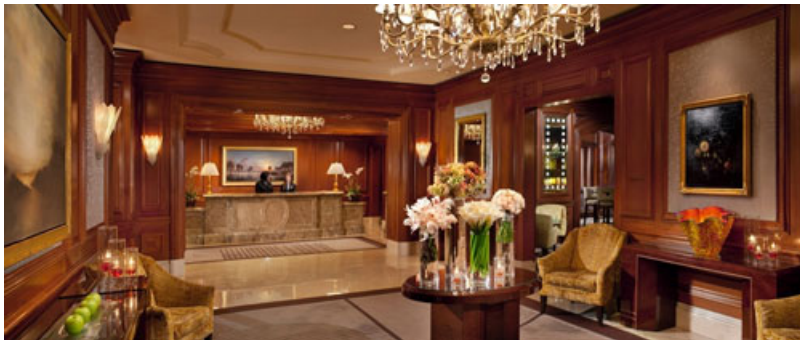
The experience begins at reception and when you write your entry in the guest-book, your signature could rub shoulders with that of a Prince, or a former Secretary of State.

Once inside, everything on offer is available at no additional charge. Canapé-style portions of delicious foods keep flowing from the kitchen. Exquisite Alaskan smoked salmon, so finely sliced it looks like coral gossamer strands curled around your fork. If you have a sweet tooth, the dessert presentation in the evening will make you think you're in Charlie's Chocolate Factory. When one of the staff noticed I wasn't eating dessert she asked if she would bring me fruit with sugar-free dipping chocolate or a cheese platter.