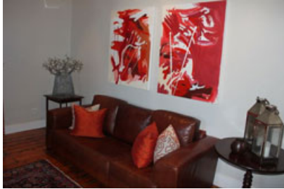
The rooms are generous... and well-served.

Four Rosmead is the kind of Cape Town boutique hotel where you would put your visiting family and friends who can afford to fly First but choose Business class instead.