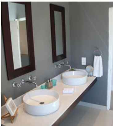
The bathroom is fine, but you will need to ask for one with a bath if you fancy a bit of a soak.

There was nothing missing from the room that you'd expect from a five-star establishment even though theirs is four-star graded but there were many value-adds, the next day's weather forecast along, for example and notes with some local knowledge about what to look out for when visiting the mountain, for example.