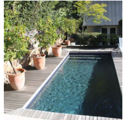
Fancy a dip? But wait for warmer weather.