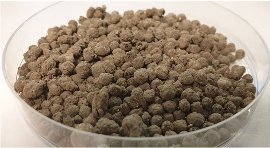
Some of the fertiliser produced by drying human urine.

The idea behind it is rather simple. Fresh urine is collected from urinals or specially designed toilets and channelled into a dryer, where an alkalisng agent, such as calcium or magnesium hydroxide , raises its pH. Any water in the now alkaline urine is evaporated and only the nutrients are left behind. We can even condense the evaporated water and reuse it for flushing toilets or washing hands.