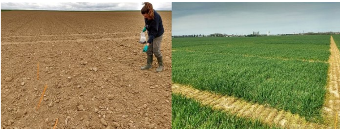
Field trials on farmland outside Paris revealed that dried urine works as well as synthetic crop fertilisers.

We estimate that it would cost just US$5 (£4.20) to supply an average family of four with a year's supply of alkalisng agent. The output from the dryer is a solid fertiliser containing 10% nitrogen, 1% phosphorus and 4% potassium – a similar combination to blended mineral fertilisers .