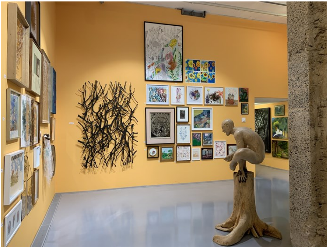
'Home Is Where The Art Is' - The Garden

There is much to see and it is an exhibition that is ideally visited more than once as new treasures would be found on each walk-through. Treasures such as a poignant tribute triptych - a submission by a loving partner of the last three works a woman created before her recent passing, an onsite mural, a lockdown countdown, a humorously placed portrait of Nelson Mandela laughing in the direction of a depiction of Trump spewing what I assume is excrement, a collection of drawings - one for each day of the lockdown. Countless more paintings, sculptures, installations, photographs, tapestries and drawings jostle for attention yet complement each other in a refreshingly ego-free way.