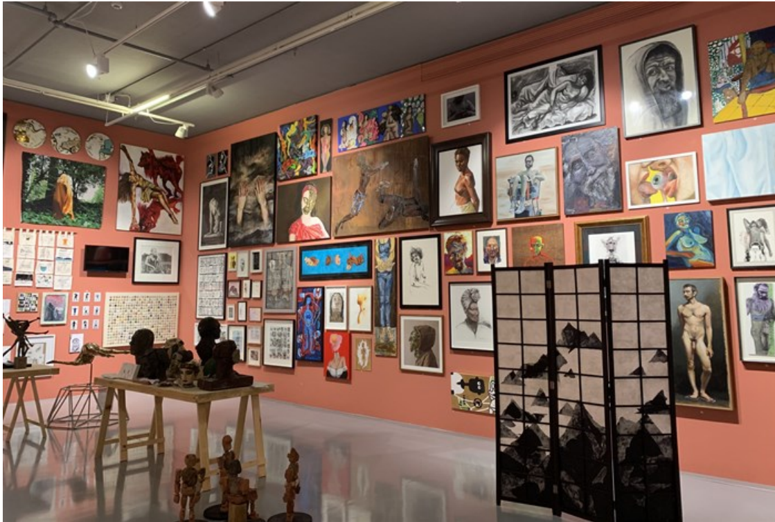
'Home Is Where The Art Is' - Relations

Nearly 2,000 artworks were submitted and one would rightfully feel that an exhibition of such magnitude and diversity might be an overwhelmingly higgledy-piggledy mess. However, the team of 11 curators have certainly earned their titles and, in a relatively short time period (around two weeks!), organised and displayed the works most thoughtfully. Noticing common themes and subject matter during the entry process the curatorial team grouped the works into distinct categories, i.e. The Garden, Inside, Outside, Relations and Time. These themes are then grouped via different rooms across the third floor of the museum, with artworks displayed salon-style - from floor to ceiling.