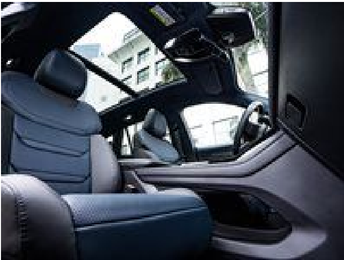
The vehicle, available in three variations (ambiente, trend and top-spec titanium), possesses a 1,8l EcoBoost petrol engine, produces 138kW and 318Nm, and features a seven-speed dual-clutch transmission.

For more, visit: https://www.bizcommunity.com